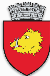
Roman City Hall